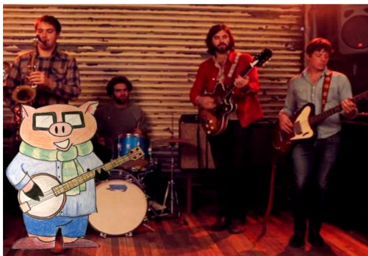
Finally a group that understands my love for the banjo #folkmusicisnajoket #apickingoodtime