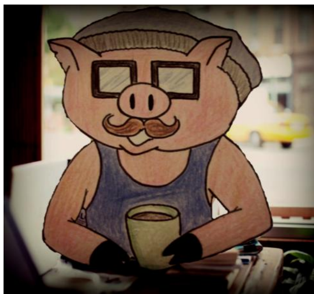
Getting this organic latte all over my new 'stache. #coffee craving #haironmychinnychin