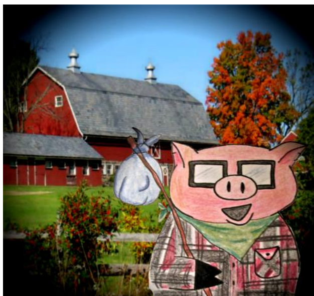
Goodbye home. Hello open road. #adventure